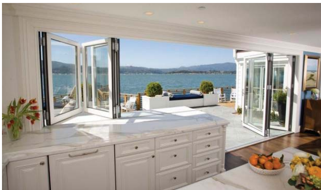
Inside Outrageous: NanaWall Grand Transformations

Throw it Open Don't think of the outdoors as a separate part of your home. Rather, think of it as part of the square footage of your home and blend the outdoors with the indoors by minimizing or eliminating the visual and physical barriers between the two. Aluminum sliding glass doors, although affordable, are being substituted with trendy folding glass doors (doors that open like bi-fold doors on closets). They can open