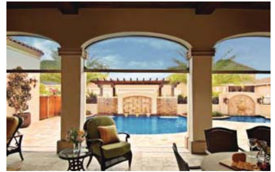
Phantom Retractable Screens

Roll it Down Living outdoors isn't enjoyable with pests like mosquitoes or flies about. So retractable screens are also a new trend for outdoor living spaces. These screens, which can be motorized, are hidden inside part of the beam and they roll down between columns to the floor to close off a back patio or a front porch from pests. Some screen colors and styles offer protection from the sun's ultraviolet rays and some even hold in cool conditioned air.