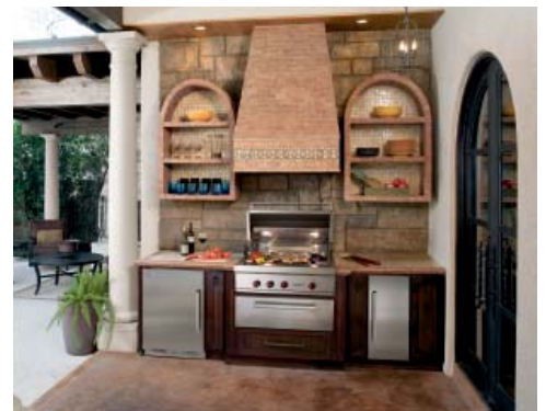
Wolf & Sub-Zero Outdoor Appliances

Food Network At get-togethers, everyone seems to flock to where the food and the drink coolers are. Outdoor kitchens and detached cabanas - some complete with a gas grill, bar top and refrigerator-are still very popular. Gas grills are getting larger and more sophisticated and include desirable features such as