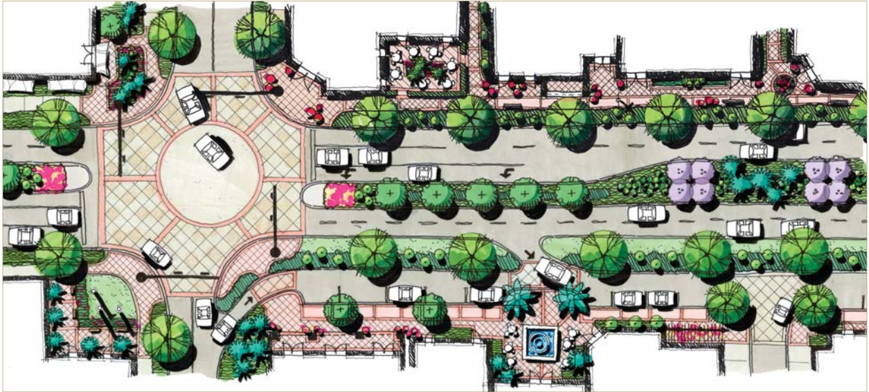
fairbanks illustrative plan