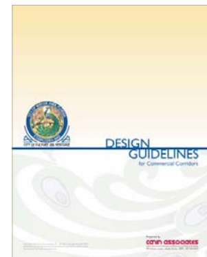
design guidelines book