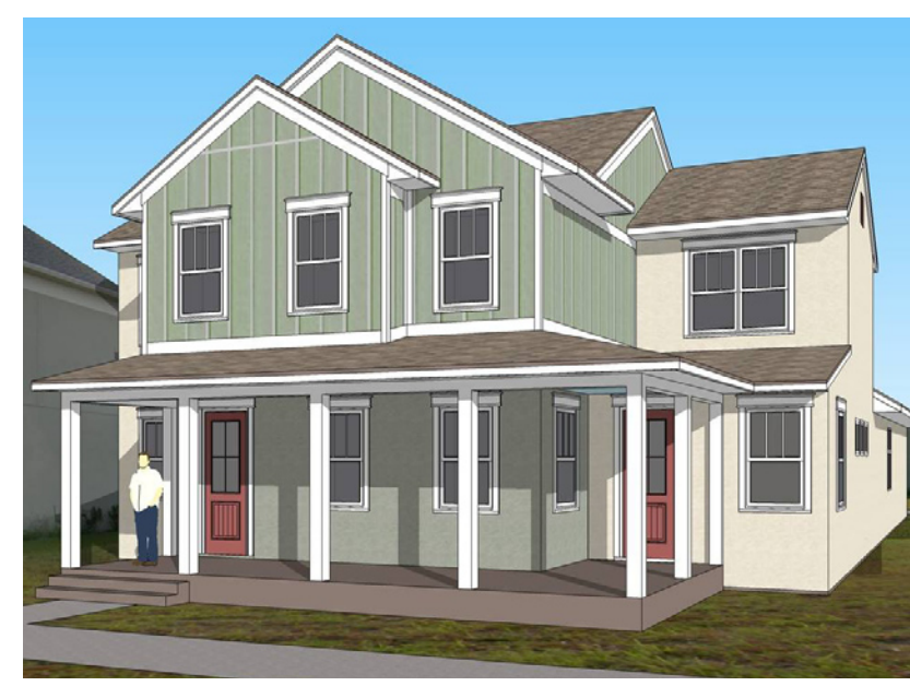
a color scheme with 3 hues adds curb appeal to this transitional styled home

The effective use of color will add curb appeal, value and overall enjoyment to your home. If you are unsure about the right colors for you, consult with a design professional. They can help you choose the right colors for your new home, remodeling or repainting project. Decide on your own style and focus in order to determine your color preferences. Whether you choose contemporary and bold, traditional or elegant, you enhance your home's appearance with your own color choices.