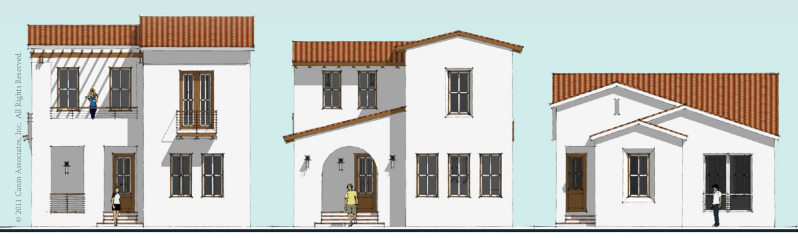
cottage homes in white appear larger

2 Lighter colors (especially white) make houses appear larger. White or off-white is ideal for smaller homes. Use white to make your home stand out on the block.