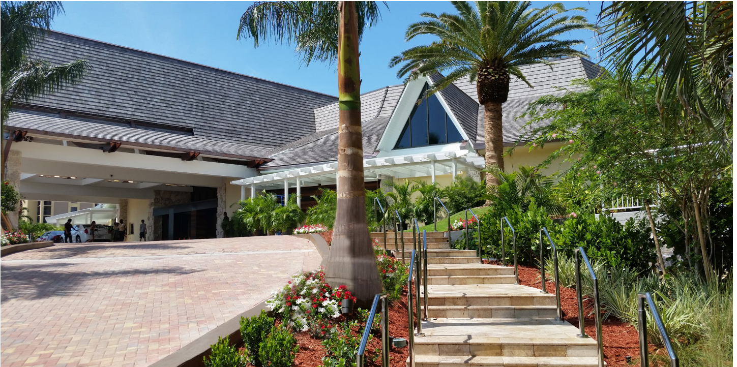
porte cochere arrival