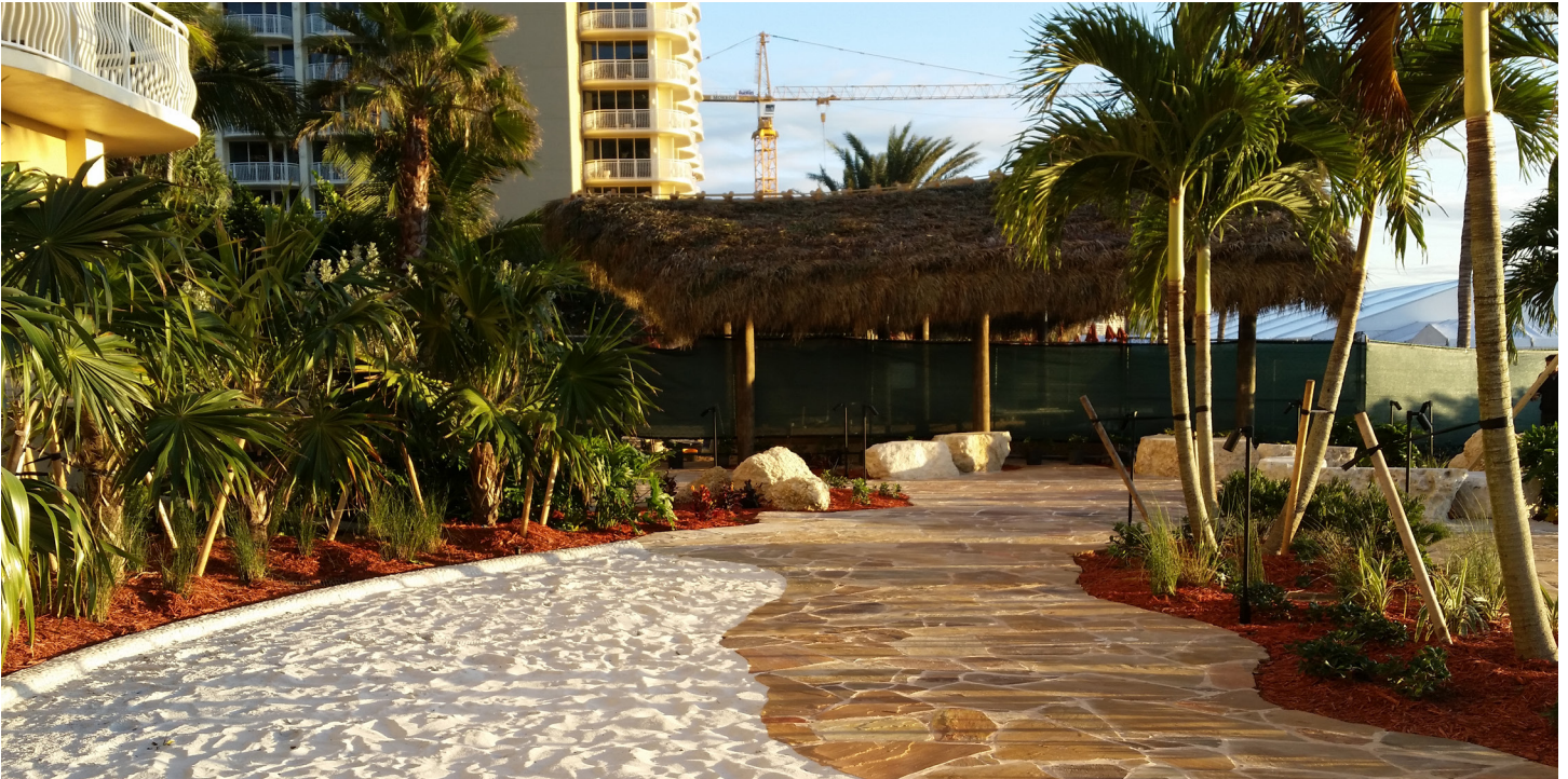
new beach side tiki bar