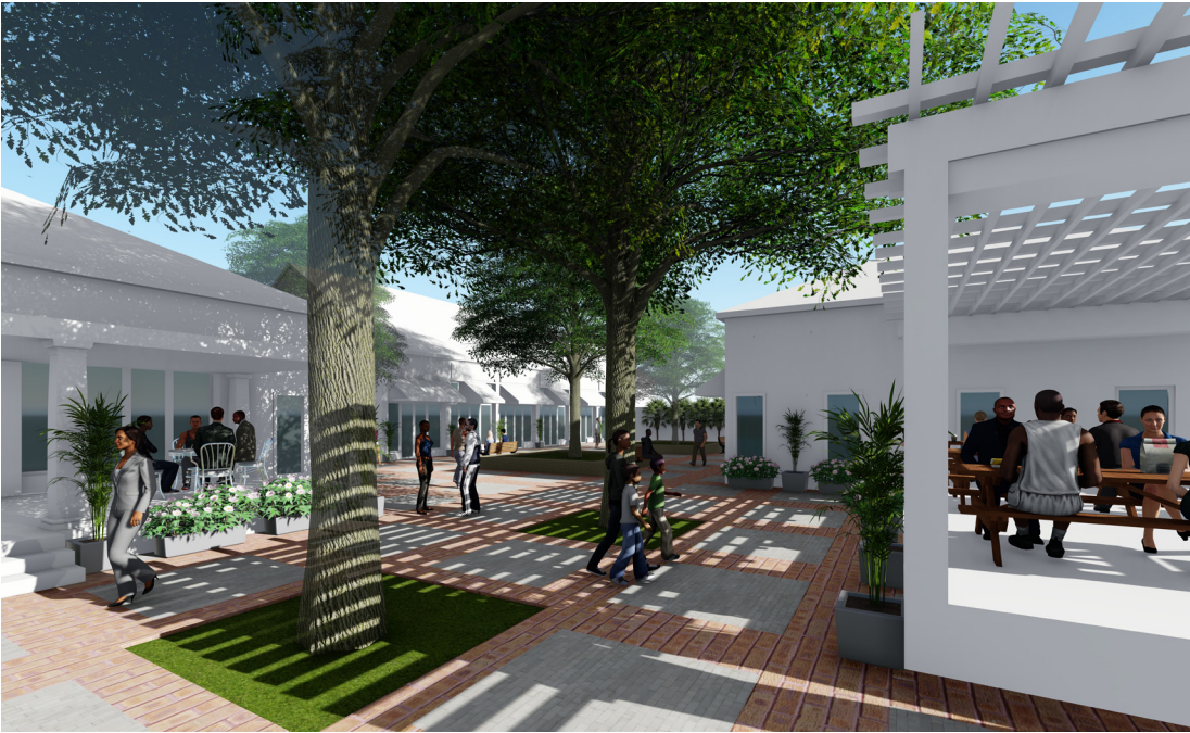
Neighborhood Center Concept

© 2018 Canin Associates, Inc. all rights reserved