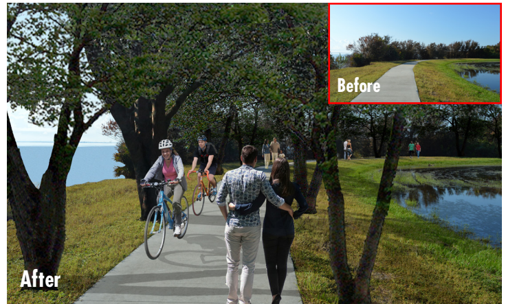
Waterfront Enhancement Visualization