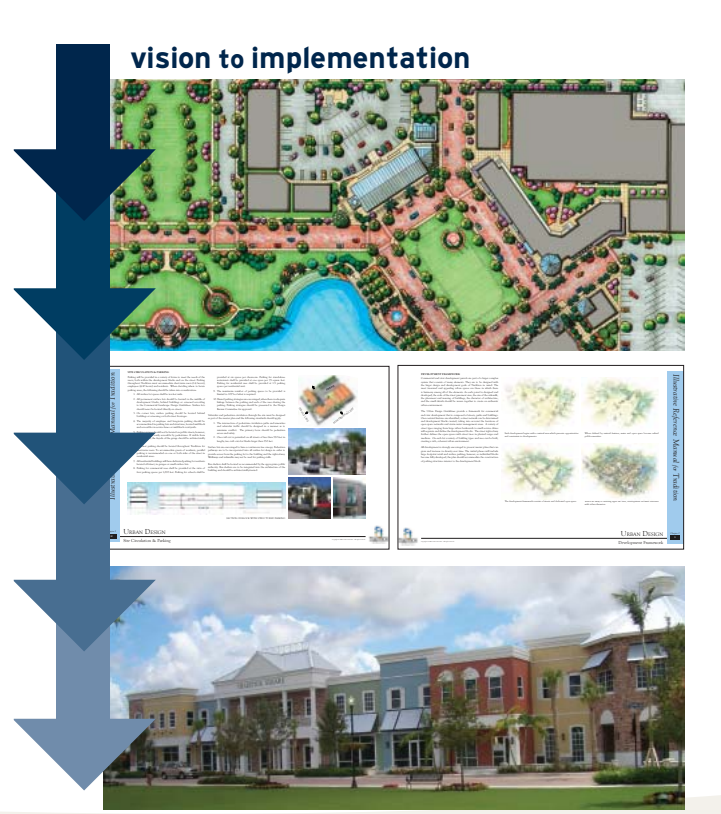
Concept Plan > Design Guidelines > Construction. Tradition, Port St. Lucie, Florida

Canin Associates has the experience necessary to create exemplary design guidelines and pattern books for a variety of project types and scales. These are the tools that provide the guidance and authority for successfully implementing a project vision. We understand that each place is unique, and that design guidelines need to be formulated to suit the particular place for which they are developed. Our team of diverse professionals has prepared design guidelines and managed their implementation as Town Architect for cities and developments across the country. Our design guidelines are comprehensive and functional, based on our research and experience.