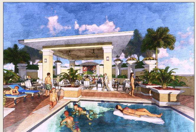
The Tower Residences - The Tavern

C anin Associates was recently awarded a new project to renovate the third floor amenity deck at the Tower Residences in Sarasota. The Landscape Studio and Architecture Studio will be collaborating for this prestigious Ritz Carlton property. Our team won the competitive project by developing a cohesive plan for multiple “out door rooms” to be created, highlighted by a new outdoor kitchen called The Tavern. Other new outdoor spaces include a yoga/flex lawn, a meditation garden, a cabana and a new bocce court. The new amenity offerings will help the property stay competitive in the market. ■