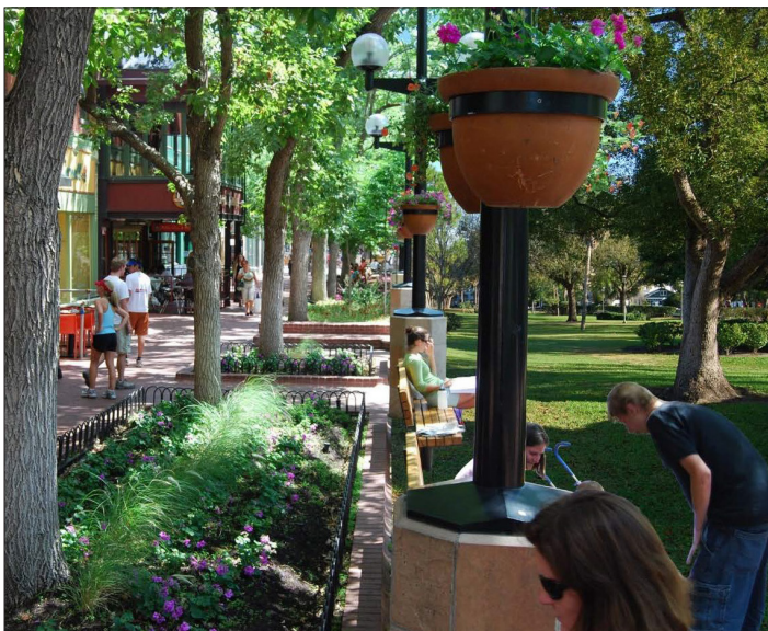
Titusville - Town Center