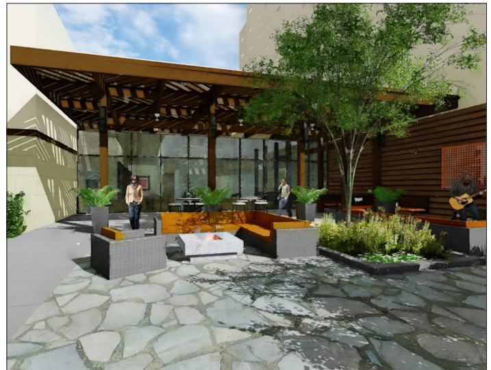
Orlando Renaissance - Outdoor Hub Area

Grading and drainage concerns were an issue for this space constrained site as the new ballroom encroached into adjacent berms and the existing trees. The team used natural flagstone and boulders to highlight paved areas and provide a natural appeal with durability. ■