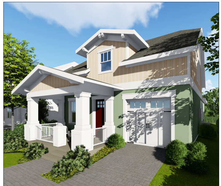
Orlando Infill Lot

These remarkable new models being built in Orlando prove that a successful development team can be part of a solution and can serve as a successful design/build model that can be replicated in other cities, or other infill lot developments to meet the growing need for attainable housing. ■