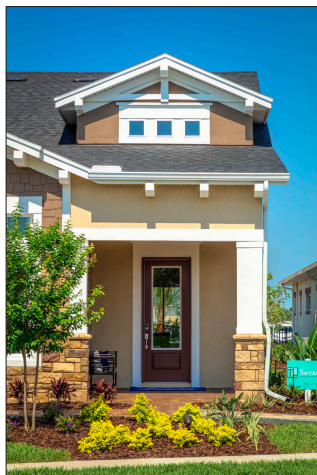
Twin Lakes Model Homes