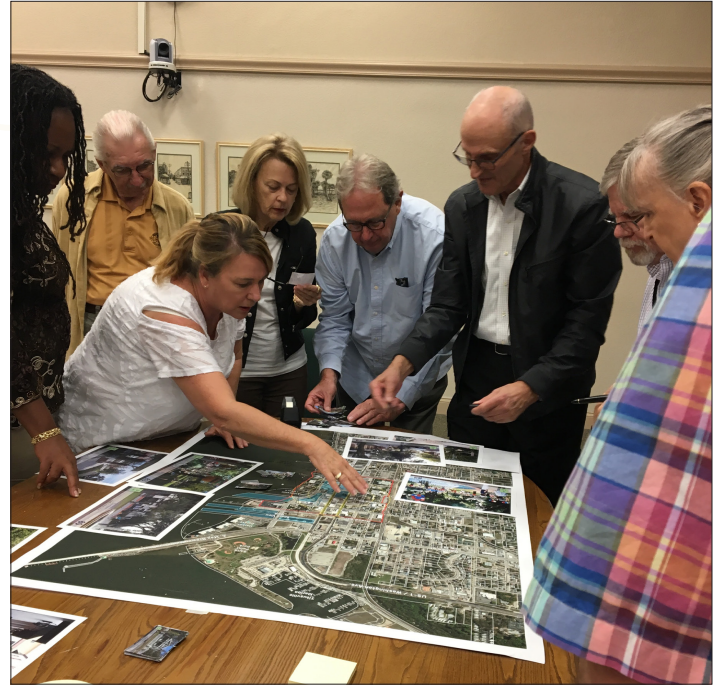
Titusville - Workshop

Our team's recommendations include simplifying and reorganizing the comprehensive plan into key multi-disciplinary elements focused on the themes identified by the vision as well as important fundamentals like neighborhoods, housing, multi-modal transportation, and employment opportunities. ■