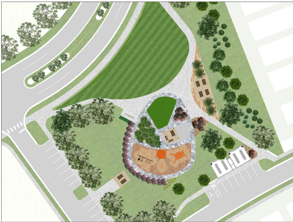
The Hills Park Plan

The Landscape Studio has been hard at work in collaboration with Sunterra Communities in bringing a new community in Minneola to life. The project, initially called the Hills of Minneola, is currently under construction both north and south of the Hancock Road interchange on Florida's Turnpike. Our team has helped create the overall design character, design guidelines and construction documents for multiple phases of the project including the commercial area and Citrus Grove Road that includes two roundabouts. The design character is inspired by the rolling hills of the area with undulating walls and sculptural elements. The streetscapes and parks have a mostly native palette highlighted by native ground covers and canopy trees. ■