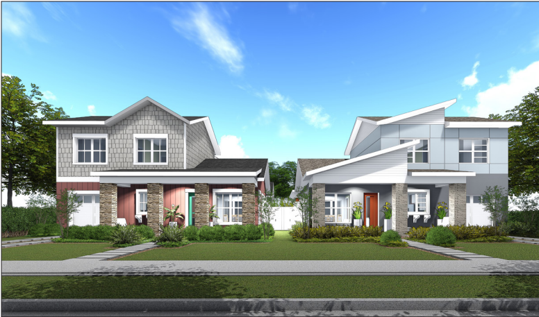
Traditional and Modern Styled Duplexes

Working within the City of Orlando's strict site development standards for R-2 zoning on two infill lots in College Park, Canin Associates is completing construction documents for four new innovative 1,450 sq. ft., two-story duplex plans that live large with private rear-yard courtyards. Vegetation in the courtyards helps to divide the hardscape and provides a connection to nature for the homeowners overlooking the space.