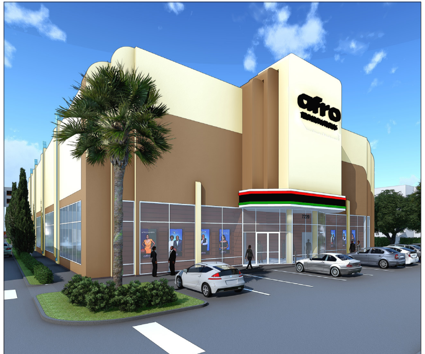
Afrotainment Television Studios

Canin Associates' Architecture Studio has had the opportunity to work on a studio remodel design for Afrotainment. Located on International Drive, the television studio is 30,000 square feet. The existing building lacked character so Canin proposed expanding the center of the existing façade and incorporating a marquee sign above the