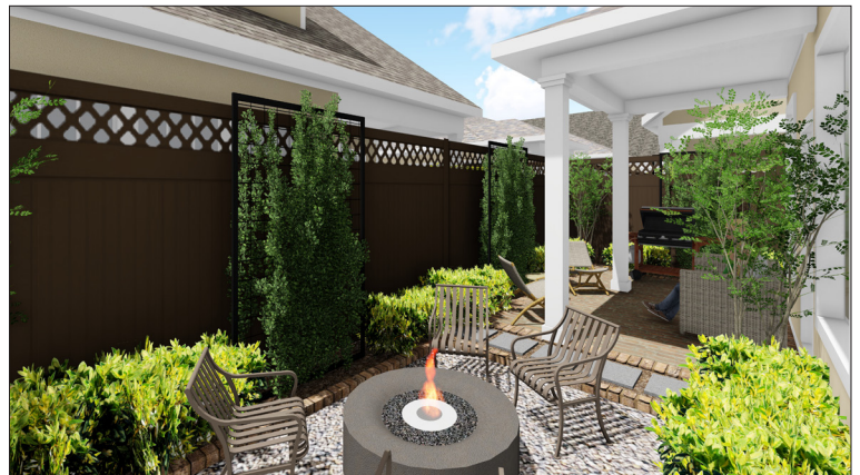
Encore: Charleston, SC

The Landscape Studio recently completed a design package for the Charleston division of David Weekley Homes. The challenge was to add value and utility to small, constrained courtyards. Adding some Charleston flair with local materials helped create the desired effect.