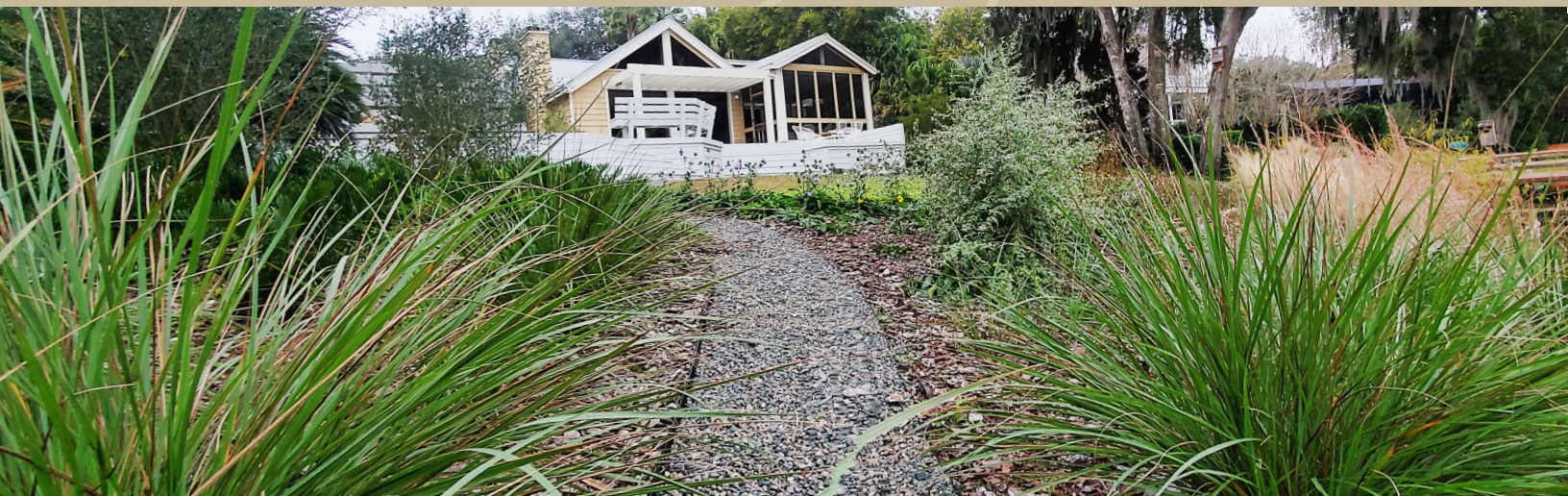
Native Landscape Example at the Canin Residence