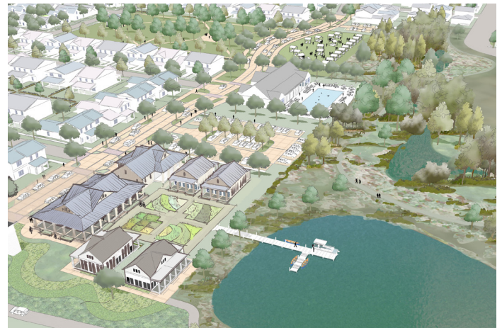
Sustanee Nature Education Center Rendering

Permanent funding is considered essential to enable the long-term objectives of learning, research and scholarship related to best management practices. To this end, the developer CHCG Land Services will create the Sustanee™ Foundation at an initial stage in the development. This nonprofit foundation will rely on a guaranteed income stream to sustain the programs in the community which will continue long after the last home is built at Sustanee™ ■