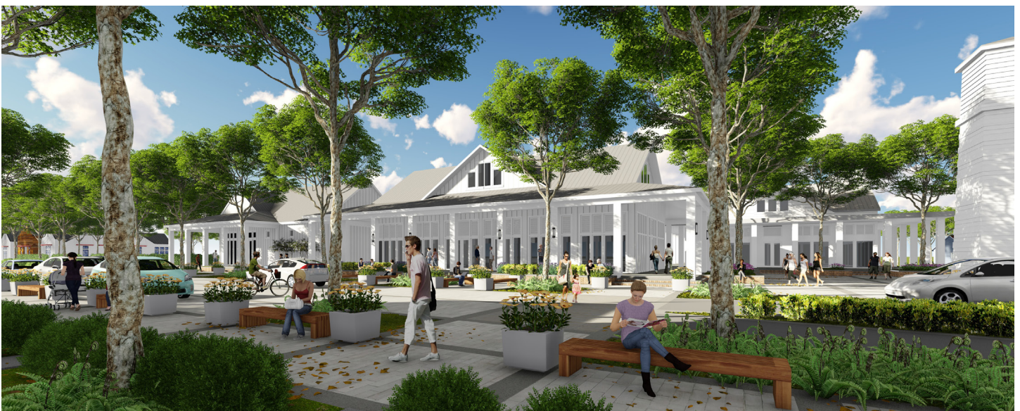
3D development rendering