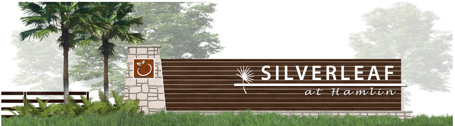
Silverleaf Signage Design Elevation

existing aesthetic of the community but stand out due to the primary use of composite wood features and bold white accents. The first phase of development includes townhomes, a county public park, and two new school sites for Orange County public schools. The second phase of development includes approximately 320 residential lots that are adjacent to conservation lands. Within the second phase, the Canin team designed multiple community park sites, regional trails, and a primary amenity site for the community. Construction has just begun on the first phase of the Silverleaf project and future phases will include multiple residential neighborhoods, a public park, and a mixed-use commercial center along Avalon Road. ■