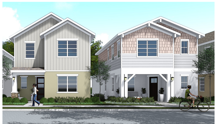
Crossprairie Bungalow Elevation Rendering

The Canin Architecture Studio has been hard at work producing a new set of rear loaded floor plans for Jones Homes. These new efficient floor plans are going to be a part of the new Crossprairie community now under construction in fast growing Osceola County in the East Toho Mixed-Use District. The homes are targeted for young families and professionals who are increasingly priced out of the Orlando market. The plans are all rear loaded and two stories. The team created new townhomes, bungalows for 34' lots and 50' wide plans. The floor plans range from 1,700 square feet up to 2,270 square feet and are unusual in that they feature master bedrooms upstairs. ■